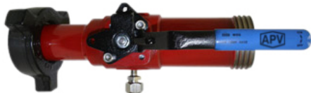
Ball Valve c/w Integral Hammer Union Ends for Quick Changeouts on Tanker Unloading Manifolds