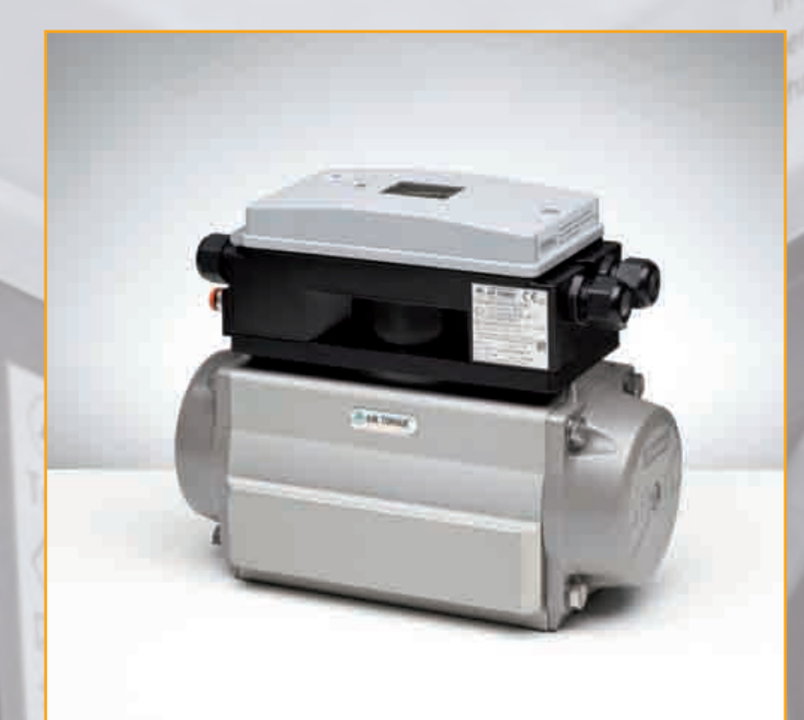
Actuator range from AT/PT200 to AT/PT650