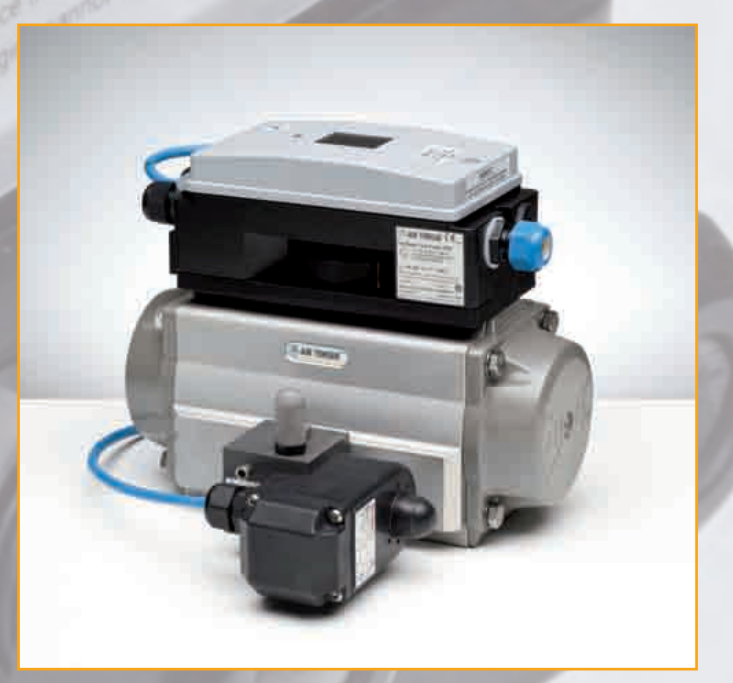
Suitable for standard solenoid valve according to customer specification